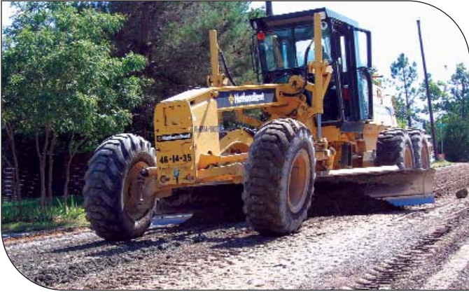
Initial shaping and grading.