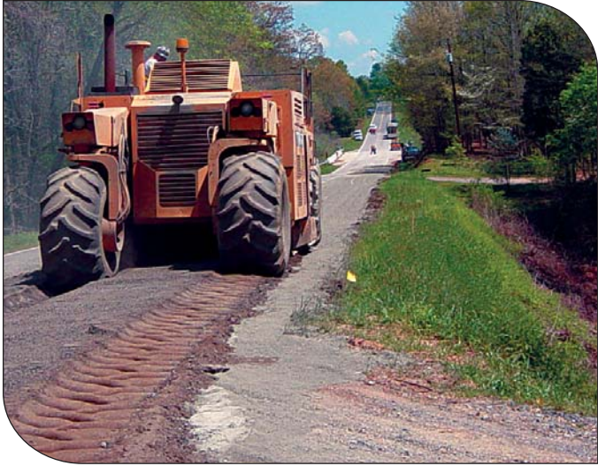
Recycling old asphalt pavement using FDR.

Full-Depth Reclamation (FDR). A special case of cement-treated base is full-depth reclamation, where aggregate for the cement-stabilized base is obtained by pulverizing and recycling the old asphalt surface and base material. This construction procedure is very similar to mixed-in-place construction, except that there is an aggregate specification for the blend of the pulverized asphalt and old base material. FDR commonly uses 4 – 6% cement and results in 300 – 400 psi (2.1 – 2.8 MPa) unconfined compressive strengths in 7 days.