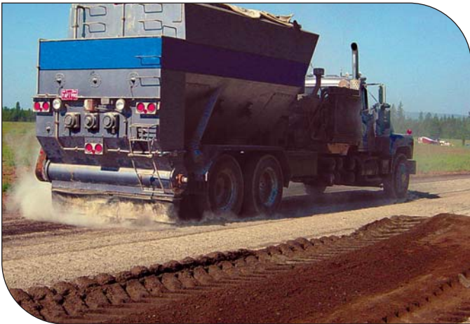
Application of cement.