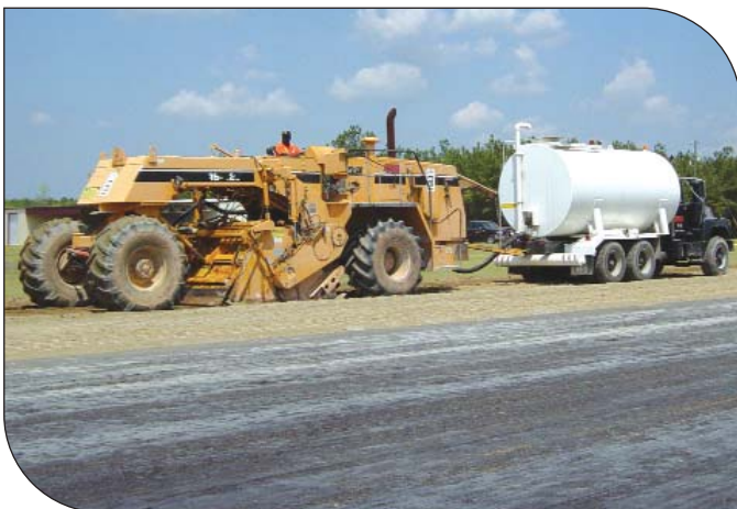
Mixing water and cement with soil.