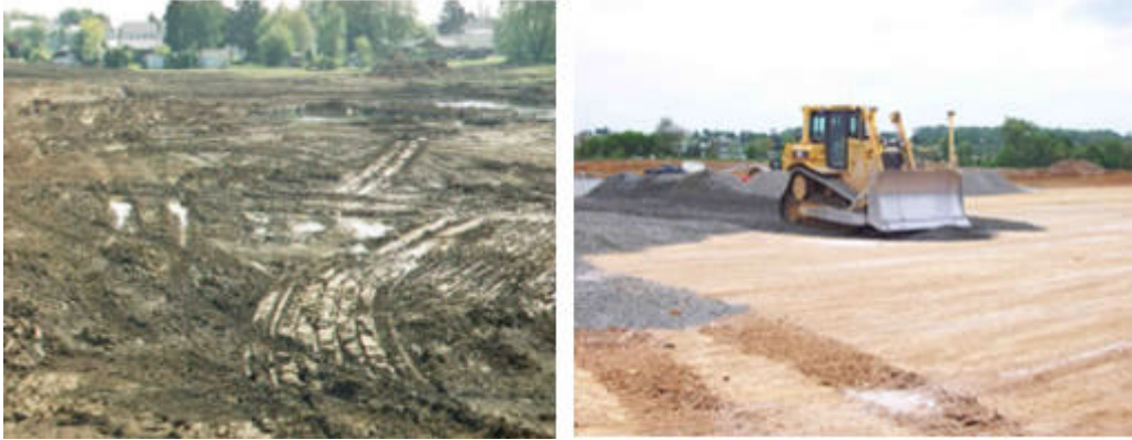
Before and after lime treatment to dry soils

waiting for the soil to dry through natural evaporation. “Dry-up” of wet soil at construction sites is one of the widest uses of lime for soil treatment. Generally, between 1 and 4 percent lime by mass of dry soil will improve a wet site sufficiently to allow construction activities to proceed.