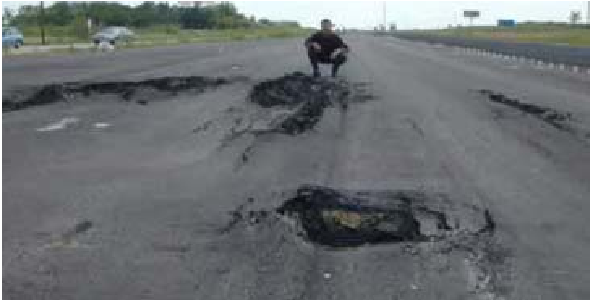
Figure 1: Extreme example of pavement failure from unstable soils

The long-term performance of any construction project depends on the soundness of the underlying soils. Unstable soils can create significant problems for pavements or structures (Figure 1). With proper design and construction techniques, lime treatment chemically transforms unstable soils into usable materials (Figure 2). Indeed, the structural strength of lime-stabilized soils can be factored into pavement designs.