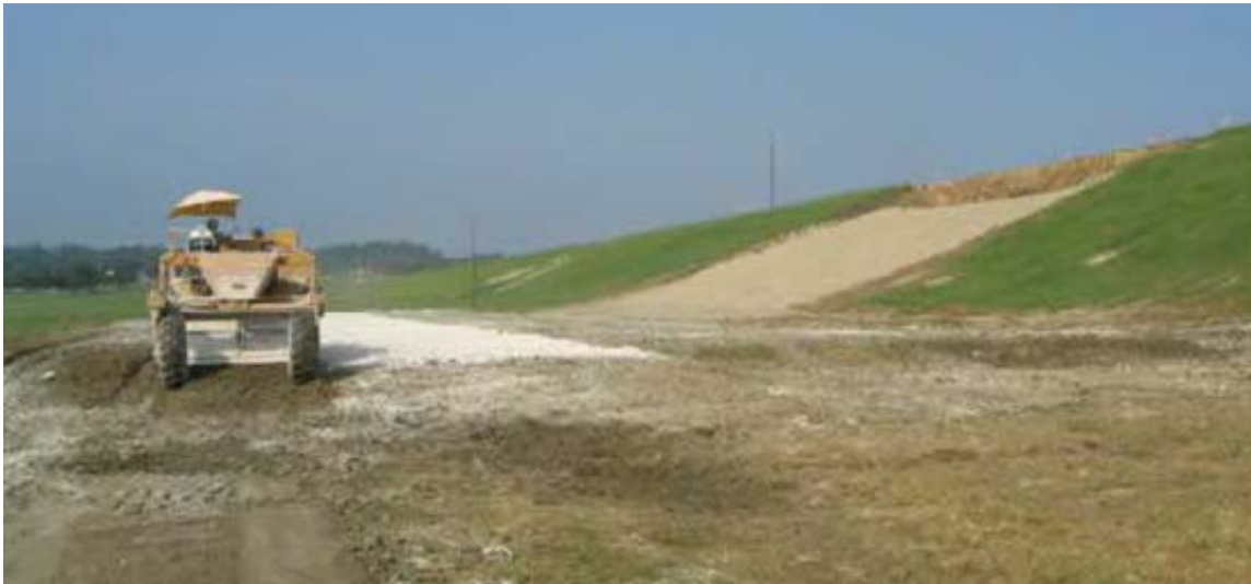
Figure 23: Preliminary mixing of lime and embankment soils in mixing area

For embankments where soil drying is the primary goal, the soil is often treated with lime after it is brought into the embankment location. The untreated soil is placed in lifts, typically 8 to 12 inches thick. Each lift is treated with lime and thoroughly mixed, lowering the soil moisture content. The lift is then compacted, another lift of soil is placed and the process is repeated until the embankment is complete. Again, it is important to ensure that adequate moisture exists or is added, particularly if quicklime is used. If quicklime is used, it is essential that all particles have undergone hydration.