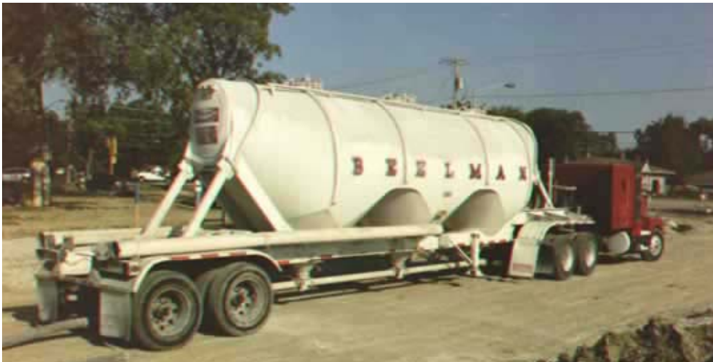
Figure 5: Example of tanker trucks typically used for dry lime delivery

Dry quicklime or hydrated lime is usually delivered in self-unloading transport trucks (Figure 5). Commonly, each load of dry lime delivered to a jobsite carries a weigh ticket certifying the amount of lime on board. In addition, some agencies require certification of the chemical characteristics of the lime delivered.