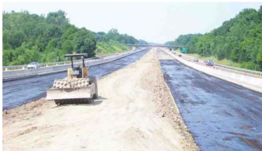
Figure 19: Prime coat emulsion for curing

Before placing the next layer of subbase (or base course), the compacted subgrade (or subbase) should be allowed to harden until loaded dump trucks can operate without rutting the surface. During this time, the surface of the lime treated soil should be kept moist to aid in strength gain. This is called “curing” and can be done in two ways: (a) moist curing , which consists of maintaining the surface in a moist condition by light sprinkling and rolling when necessary, and (b) membrane curing , which involves sealing the compacted layer with a bituminous prime coat emulsion, either in one or multiple applications (Figure 19). A typical application rate is 0.10 to 0.25 gallons/square yard.