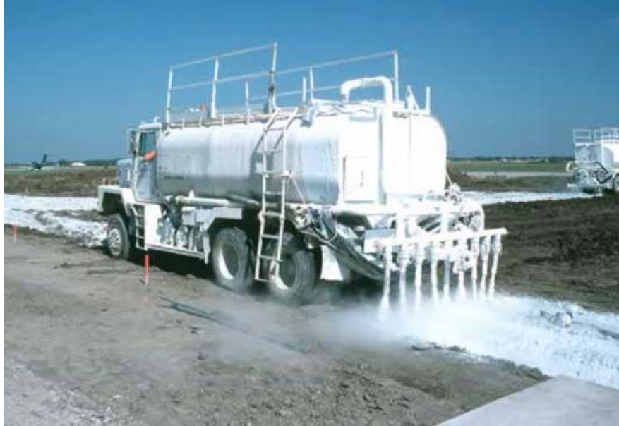
Figure 11: Example of lime slurry application