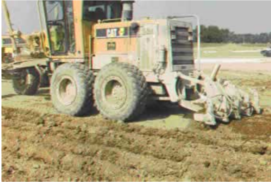
Figure 8: Scarification before lime application