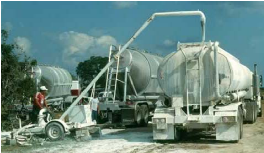
Figure 7: Jet slurry mixer

Lime slurries have lime solids contents up to 42 percent. The percent of lime solids can be tested using a simple specific gravity device (pycnometer) to insure that the correct quantity is spread throughout the project.