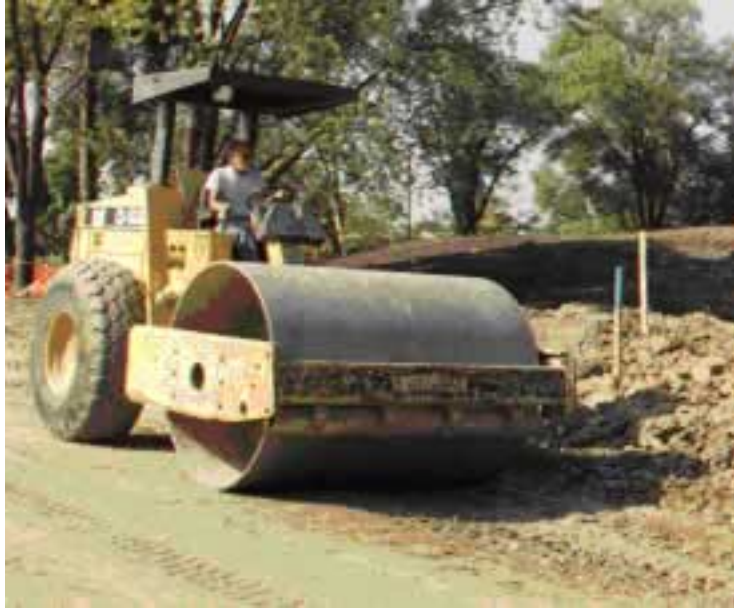
Figure 18: Steel roller