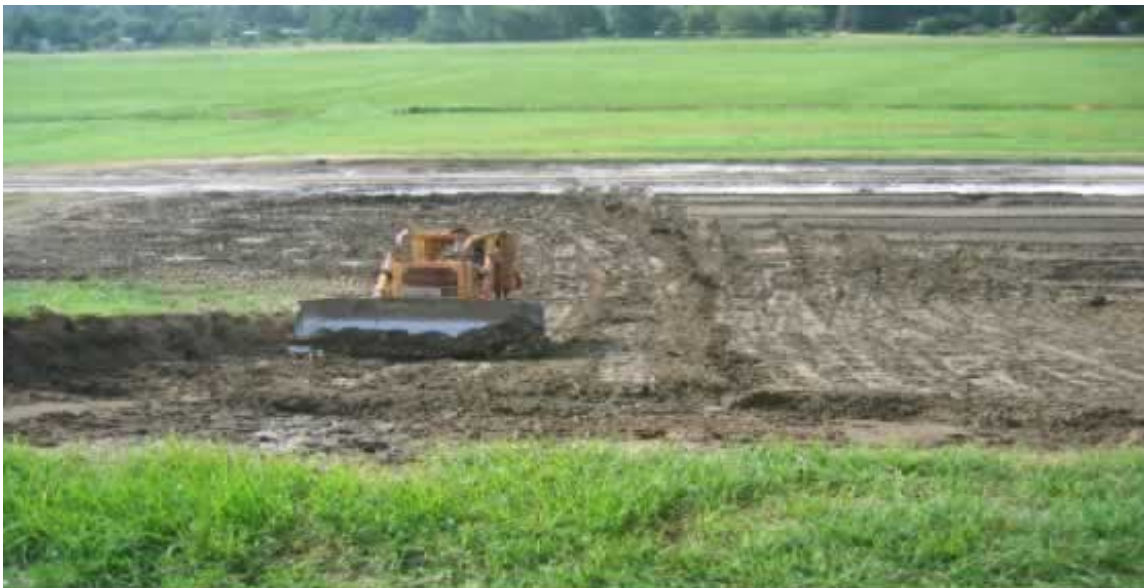
Figure 24: Returning treated soils from mixing area to embankment