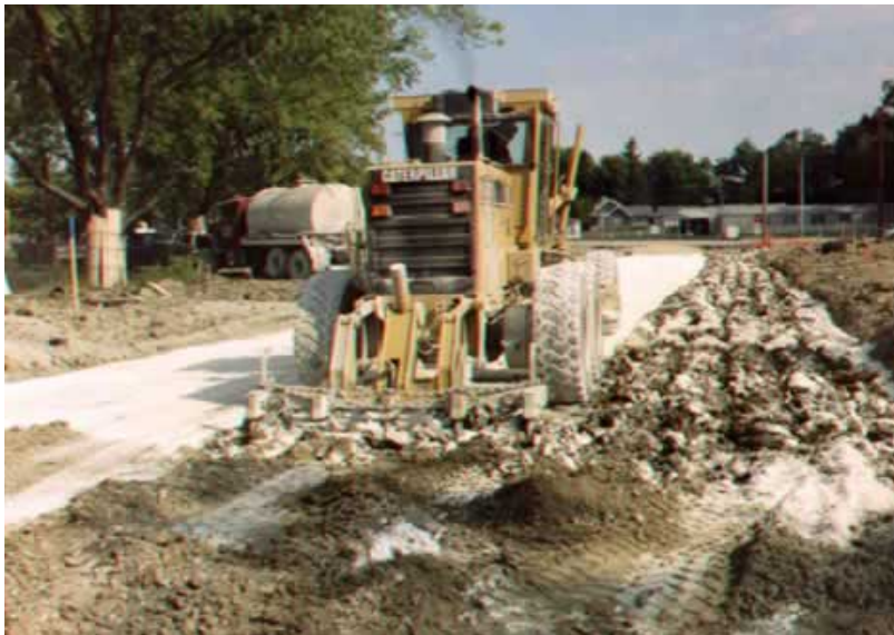
Figure 12: Scarification after lime spreading

Preliminary mixing is required to distribute the lime throughout the soil and to initially pulverize the soil to prepare for the addition of water to initiate the chemical reaction for stabilization. This mixing can begin with scarification (Figure 12). Scarification may not be necessary for some modern mixers, however. During this process or immediately after, water should be added (Figure 13).