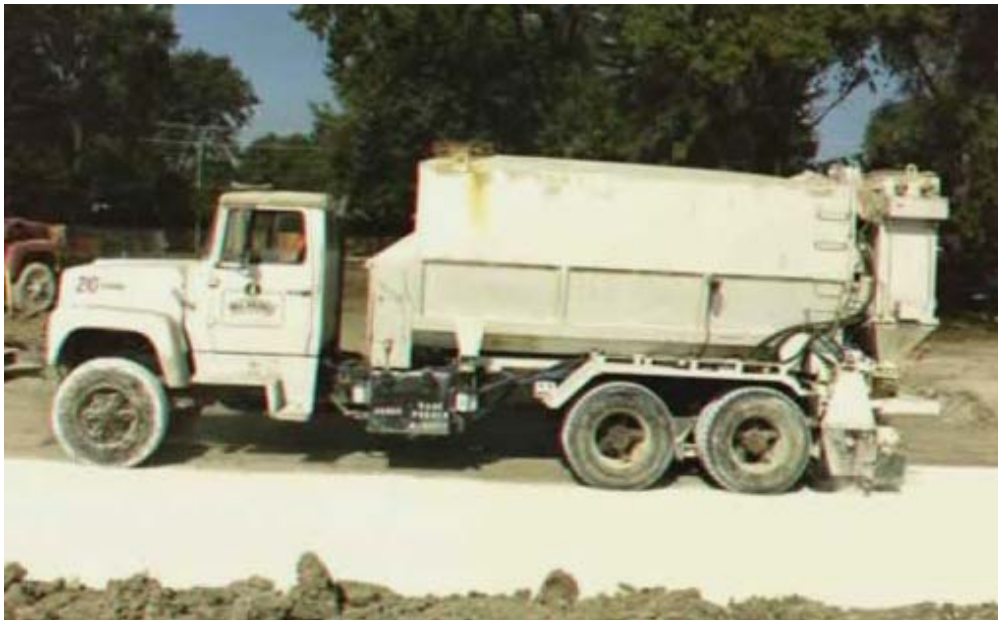
Figure 10: Dry lime application with mechanical spreader 4

For use of a pneumatic spread bar, the quicklime is typically fine sized ( \frac{1}{4} " by 0) to flow freely. A mechanical spread auger on the end of a truck, trailer, or a separate spread box can handle larger sized quicklime--typically up to \frac{1}{2} " size. The subbase can be uneven or scarified for this type of application. This application works well in very wet soil conditions.