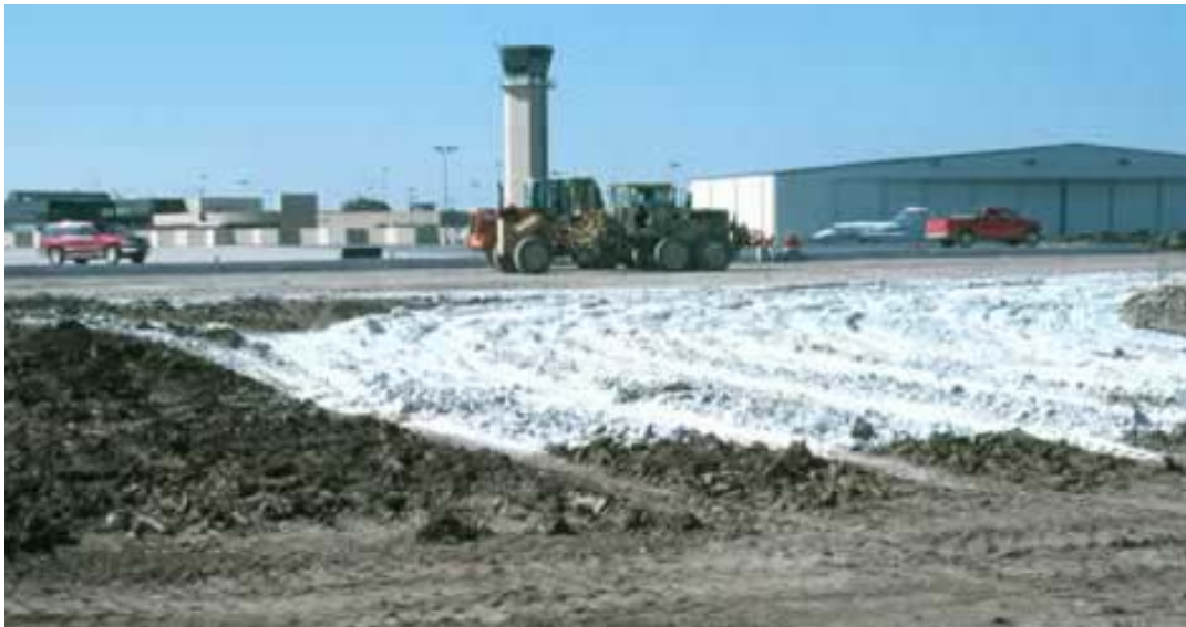
Figure 21: Lime stabilization project at an airport

Lime has an extensive history as a soil treatment option for airport construction. Examples include the Denver International, Dallas Ft. Worth, and Newark airports. Many airports in the United States are expanding by lengthening runways, taxiways, and parking aprons. New and expanded terminals are also under construction (Figure 21).