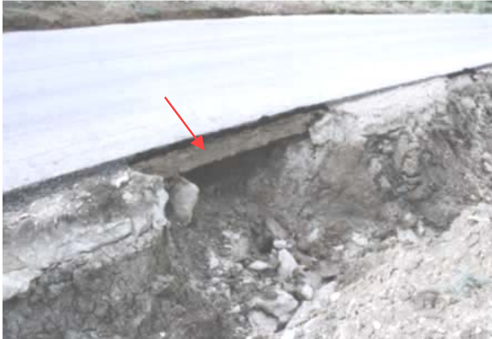
Figure 3: Lime-stabilized layer (see arrow) bridging an erosion failure illustrates strength

Soil stabilization significantly changes the characteristics of a soil to produce long-term permanent strength and stability, particularly with respect to the action of water and frost (Figure 3).