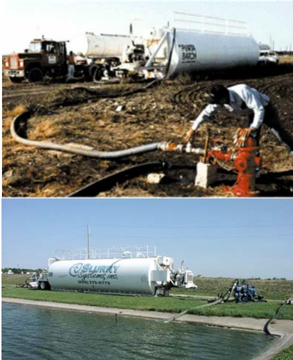
Figure 6: Portable lime slaker tanks for preparing lime slurry on-site

A second method of slurry production, which eliminates batching tanks, involves the use of a compact jet slurry-mixer (Figure 7). Water at 70 psi pressure and hydrated lime are charged continuously in a 65:35 (weight) ratio into the jet mixing bowl, where slurry is produced instantaneously. The slurry is pumped directly into trucks for spreading on the construction site. The mixer and auxiliary equipment can be mounted on a small trailer and transported to the job readily, giving great flexibility to the operation.