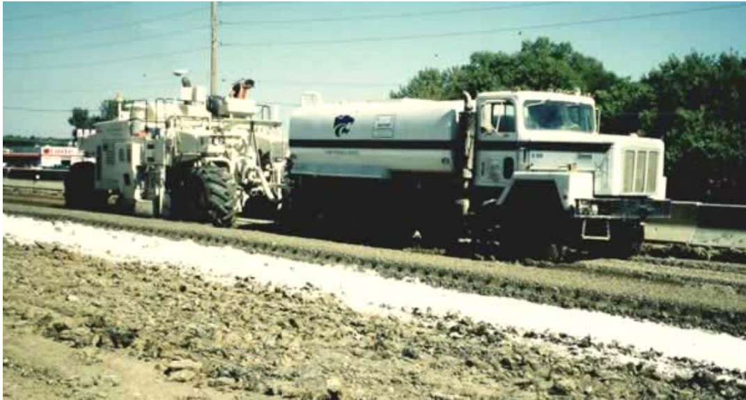
Figure 15: Rotary mixer with water truck attached

Regardless of the method used for water addition, it is essential that adequate water be added before final mixing to ensure complete hydration and to bring the soil moisture content 3 percent above optimum before compaction.