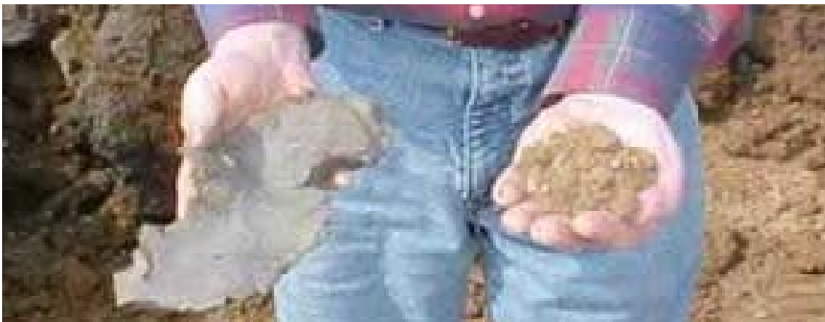
Figure 2: Comparing untreated plastic clay to lime-treated clay after initial mixing and mellowing