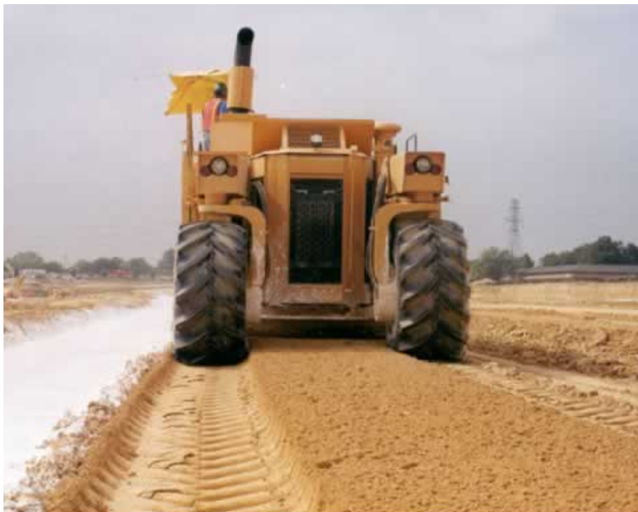
Figure 14: Rotary mixer used for initial mixing

Rotary mixers should be employed to ensure thorough mixing of the lime, soil, and water (Figure 14). With many rotary mixers, water can be added to the mix drum during soil-lime processing (Figure 15). This is the optimum method to add water to dry lime (quicklime or hydrated lime) and soil during the preliminary mixing and watering stage.