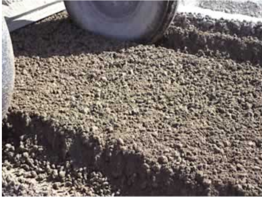
Figure 4: Lime flocculating clay