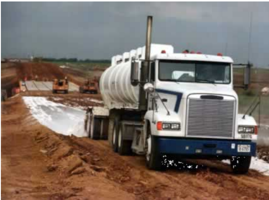
Figure 9: Soil windrow used to contain lime before mixing

If quicklime is to be discharged in windrows, a smooth surface is desired so that uniform spreading by motor grader blade can be achieved. Therefore the soil should not be scarified before quicklime is applied in this manner.