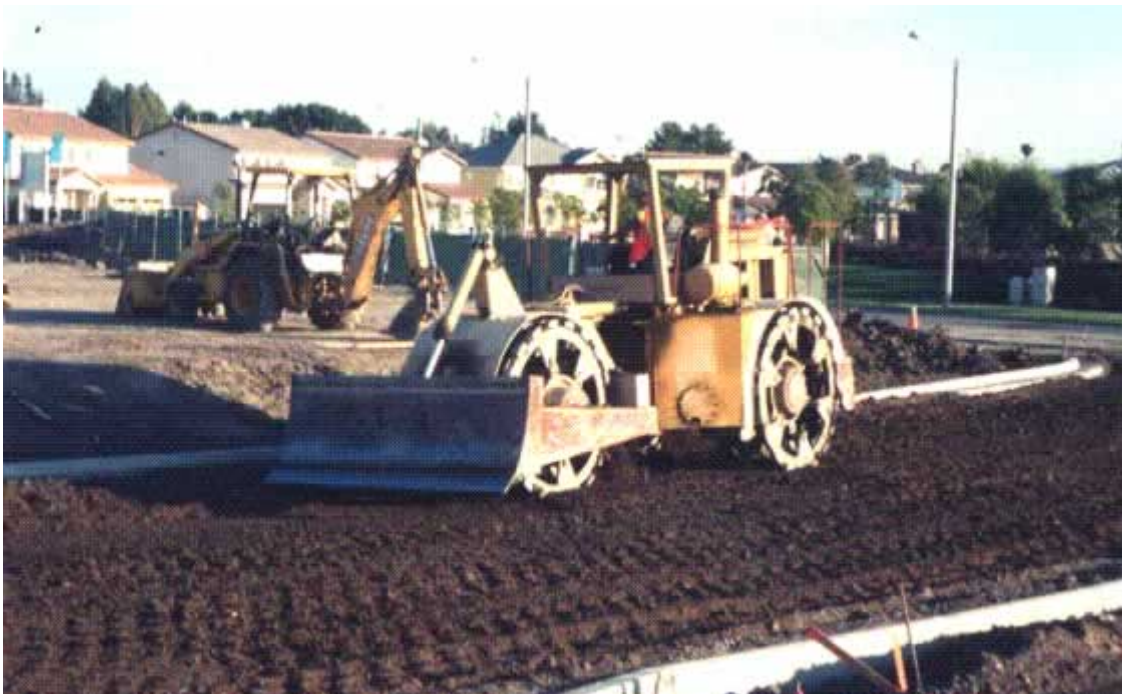
Figure 22: Compacting lime stabilized soil for base of street in housing subdivision

Subdivision Streets: The contractor begins by laying out streets and utilities. The streets are rarely without crews digging utility trenches for sewer, water, gas, and electric. With all of this digging and filling it is small wonder the streets tend to be areas of deep mud and at many times impassable. One way to mitigate this problem is to use lime in the beginning phase of construction to modify the soil and then to use additional treatments for drying trench fills. Stabilized soils can also be used as a foundation for the final pavement (Figure 22). Soils beneath sidewalks can also be stabilized to minimize sinking and buckling.