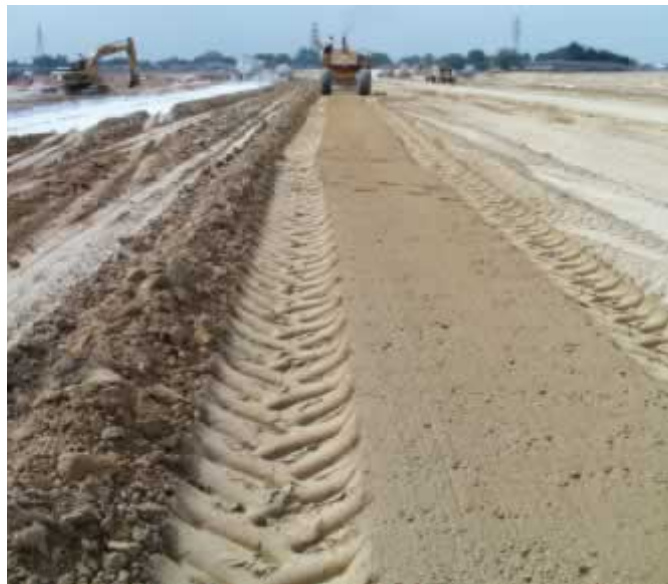
Figure 16: Mixing and pulverization

To accomplish complete stabilization, adequate final pulverization of the clay fraction and thorough distribution of the lime throughout the soil are essential (Figure 16). Mixing and pulverization should continue until 100 percent of non-stone material passes the 1-inch sieve and at least 60 percent of non-stone material passes the number 4 sieve.