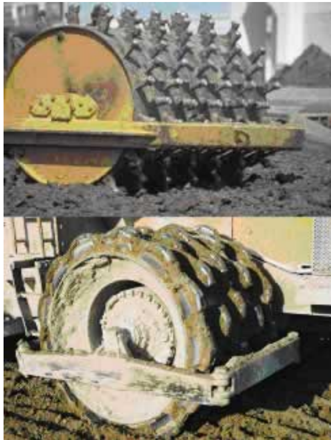
Figure 17: Sheepsfoot (above) & padfoot (below) rollers

Equipment: To ensure adequate compaction, the equipment should be matched to the depth of the lift. Compaction can be accomplished in one lift using heavy pneumatic or vibratory padfoot rollers or a combination of the sheepsfoot and light pneumatic vibratory padfoot rollers or tamping foot rollers (Figure 17). Typically, the final surface compaction is completed using a steel wheel roller (Figure 18).