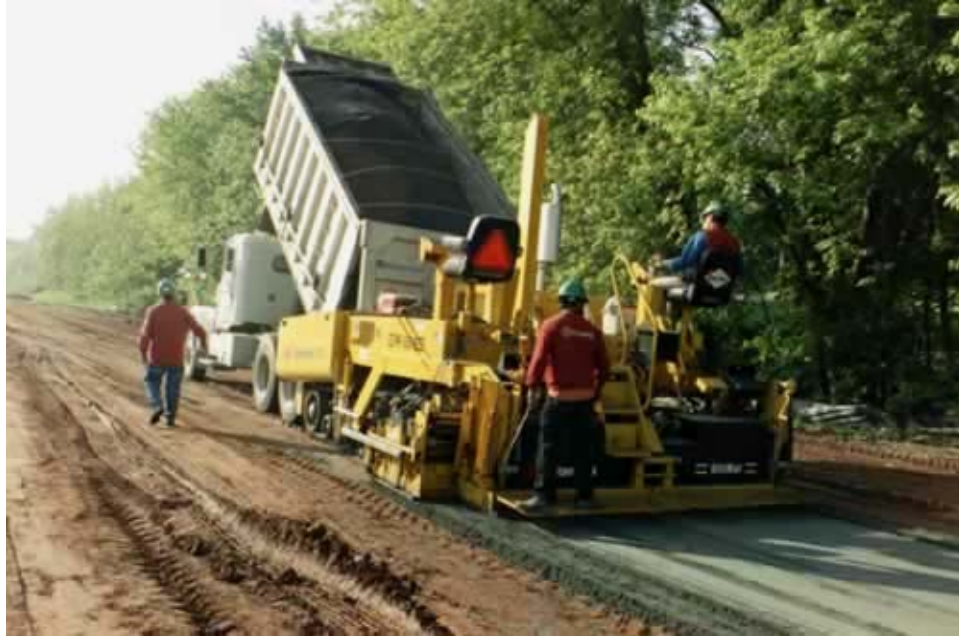
Figure 20: Asphalt paving machine used to spread moist fly ash