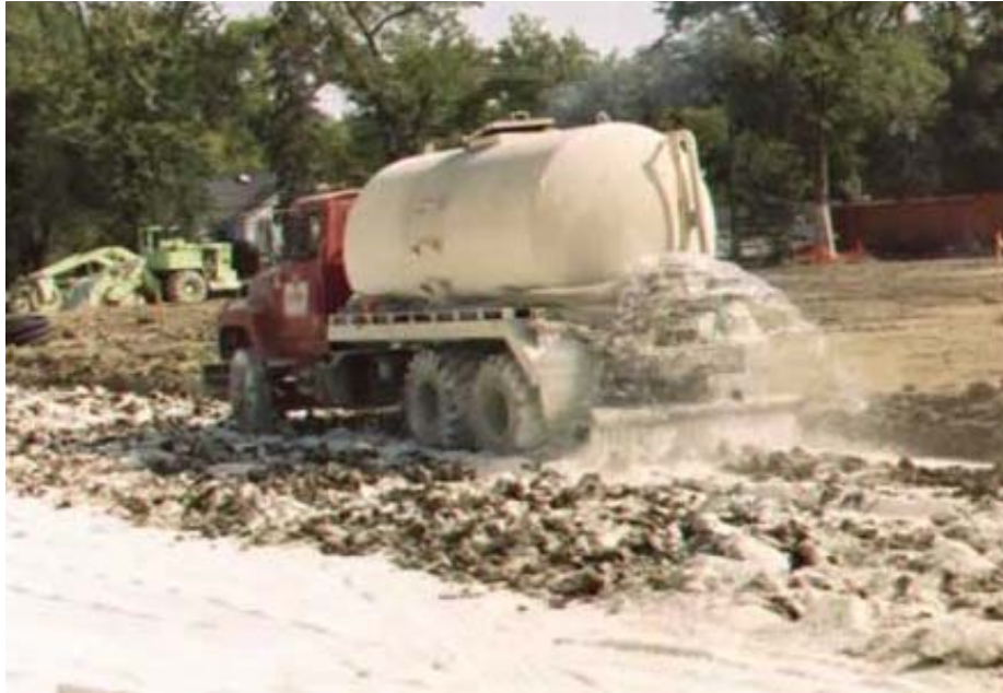
Figure 13: Adding water after dry lime application 5

Rotary mixers should be employed to ensure thorough mixing of the lime, soil, and water (Figure 14). With many rotary mixers, water can be added to the mix drum during soil-lime processing (Figure 15). This is the optimum method to add water to dry lime (quicklime or hydrated lime) and soil during the preliminary mixing and watering stage.